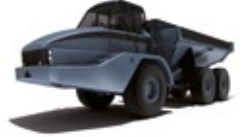
ARTICULATED DUMP TRUCKS