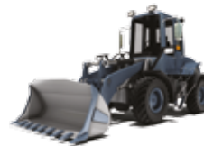
COMPACT WHEEL LOADERS